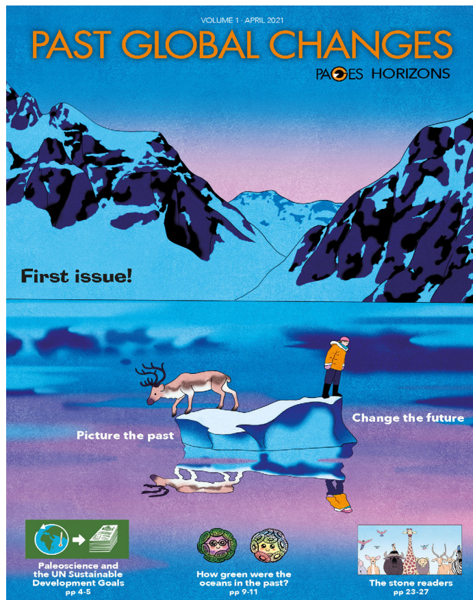
Figure 4: The first issue of PAGES' new magazine for anyone interested in paleoscience, Past Global Changes Horizons , was published in April 2021. 19

19 http://pastglobalchanges.org/products/pages-horizons